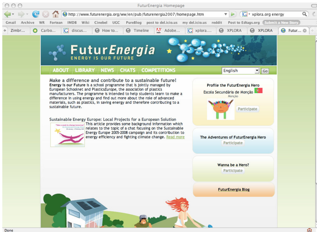
Figure 2: Futurenergia website

In its second year, the “Energy is our Future” school programme continues to focus on enhancing and supporting energy education across the curriculum in schools. The programme is intended to raise awareness on how energy consumption might affect climate change and how advanced materials such as plastics can help save energy and create a sustainable future.