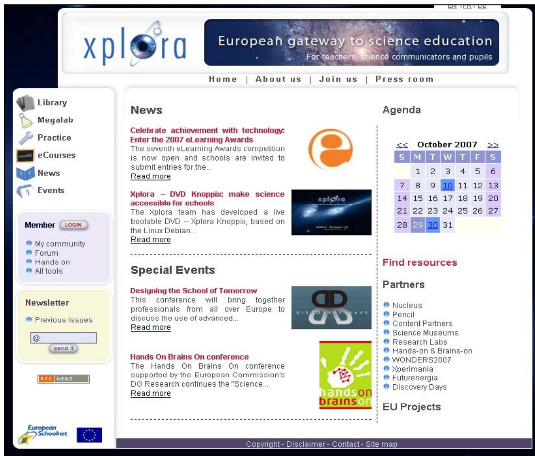
Figure 1: Screenshot of Xplora portal

EUN's work is organised in three strands corresponding to its core objective of supporting the efficient use of ICT in education and the European dimension in education: School networking and services; knowledge building and exchange on ICT policy and practice and Interoperability and content exchange.